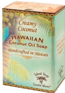
Creamy Coconut # 122 C