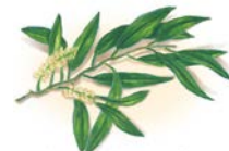
Tea Tree Oil