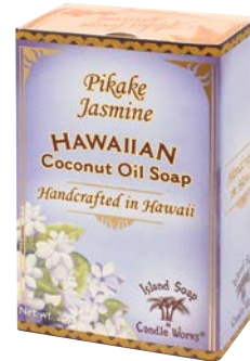
Pikake Jasmine # 122 PK