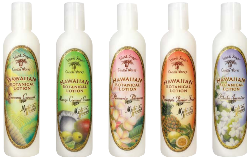
Creamy Coconut # 218C Mango Coconut Guava # 218MCG Plumeria Blossom # 218P Pineapple Passion Fruit # 218PF Pikake Jasmine # 218PK

Our moisturizing lotion goes on easily and soaks in, leaving your skin smooth and silky. We use natural skin softening botanicals such as Hawaiian seaweed extract, aloe vera, and vitamin E. Paraben Free. No animal testing