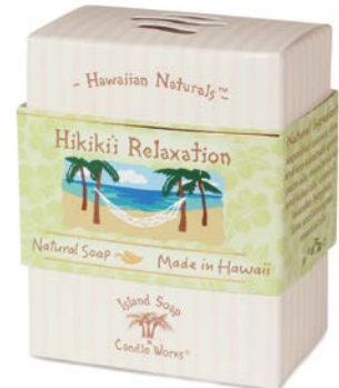
Hikiki'i Relaxation # 154RE