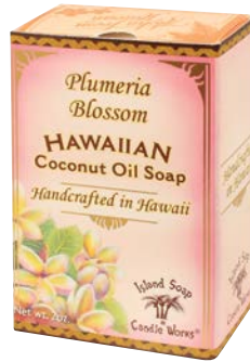
Plumeria Blossom #122 P