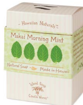
Makai Morning Mint # 154MM