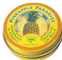
Pineapple Paradise (Pineapple) # 430PA