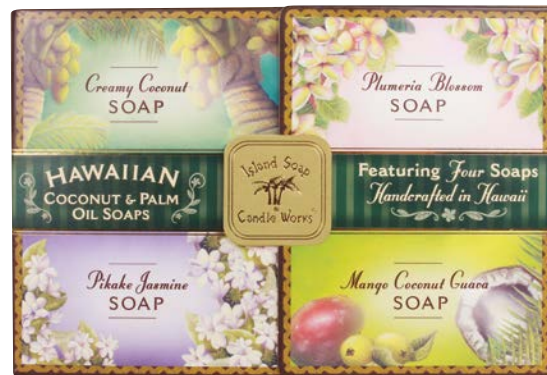
Sample Pack Box, Open

Wholesale . . . . . $8.00 Retail . . . . . $16.00