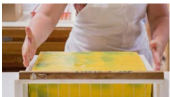
Cutting pineapple soaps