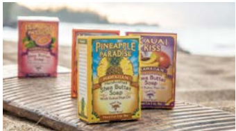
Shea Butter soaps on the beach