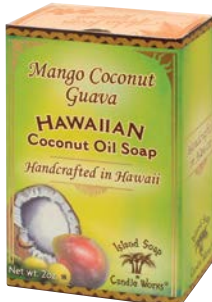
Mango Coconut Guava # 122 MCG