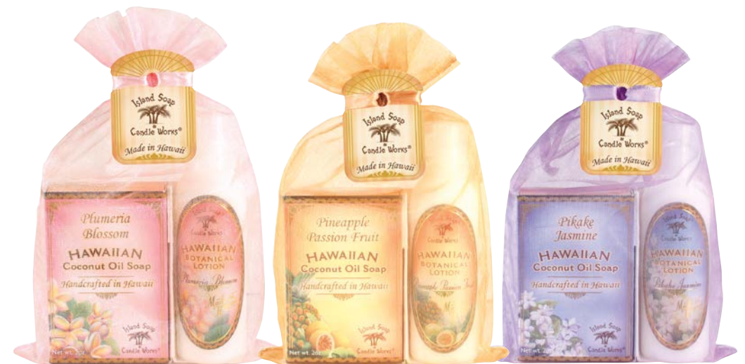
Plumeria Blossom, # 312P