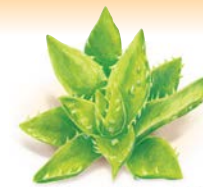
Aloe Vera Oil