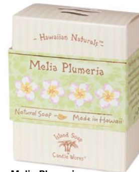
Melia Plumeria # 154P