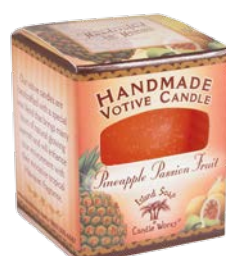
Pineapple Passion Fruit # 810PF