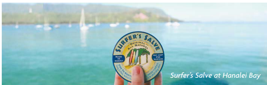
Surfer's Salve at Hanalei Bay