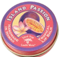
Island Passion (Passion Fruit) # 430IP