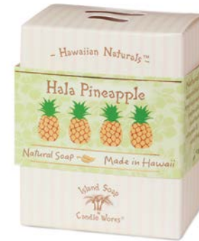
Hala Pineapple # 154PA