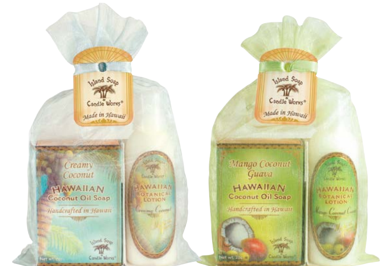
Creamy Coconut, # 312C

Wholesale . . . . . $5.00 Retail . . . . . $9.99