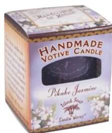
Pikake Jasmine # 810PK

Wholesale . . . . . $1.75 Retail . . . . . $3.49