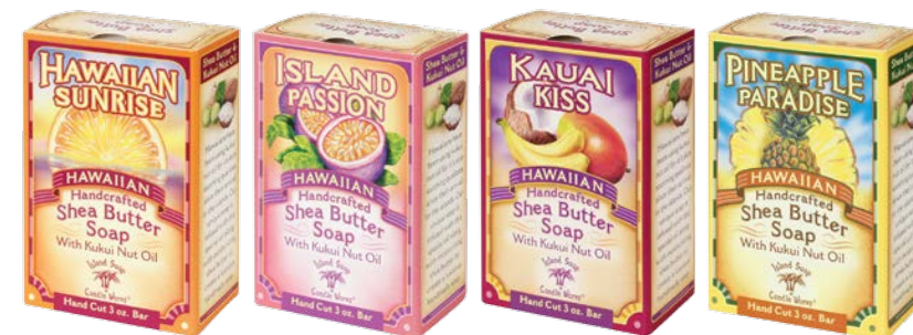
Hawaiian Sunrise (Citrus) #143HS