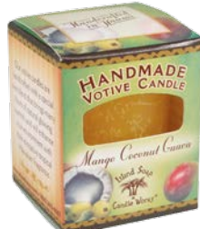
Mango Coconut Guava # 810MCG