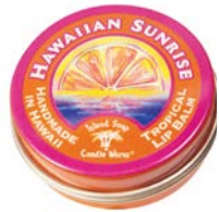
Hawaiian Sunrise (Citrus) # 430HS

Sold in case packs of 12 . . . $23.40 per pack