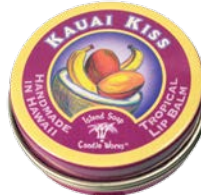
Kauai Kiss (Banana & Mango) # 430KK