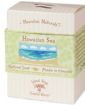
Hawaiian Sea # 154HS

Wholesale . . . . . $3.50 Retail . . . . . $6.99