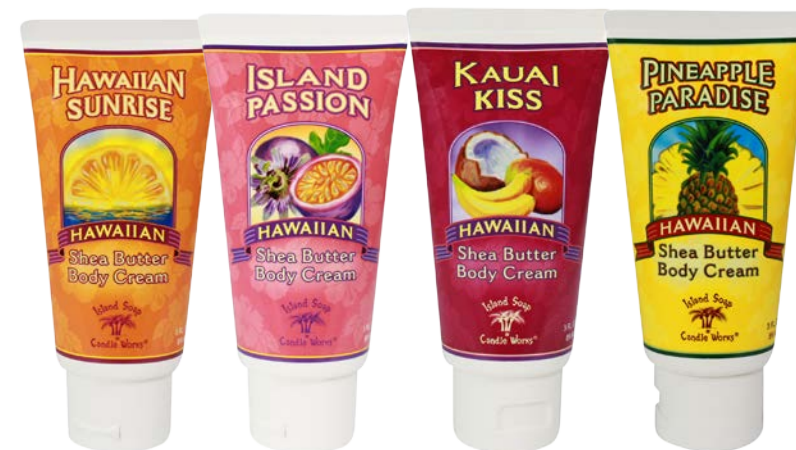
Hawaiian Sunrise (Citrus) #443HS