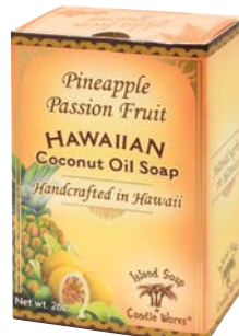
Pineapple Passion Fruit # 122 PF