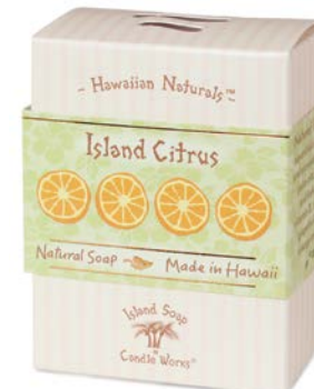
Island Citrus # 154IC