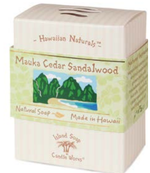
Mauka Cedar Sandalwood # 154CS

Prices and packaging subject to change. For up-to-date product information visit www.islandsoapwholesale.com • Phone orders call toll free (800) 300-6067