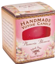
Plumeria Blossom # 810P