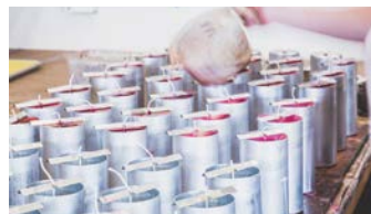
Making pillar candles