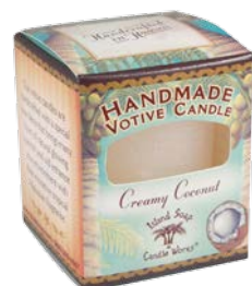
Creamy Coconut # 810C